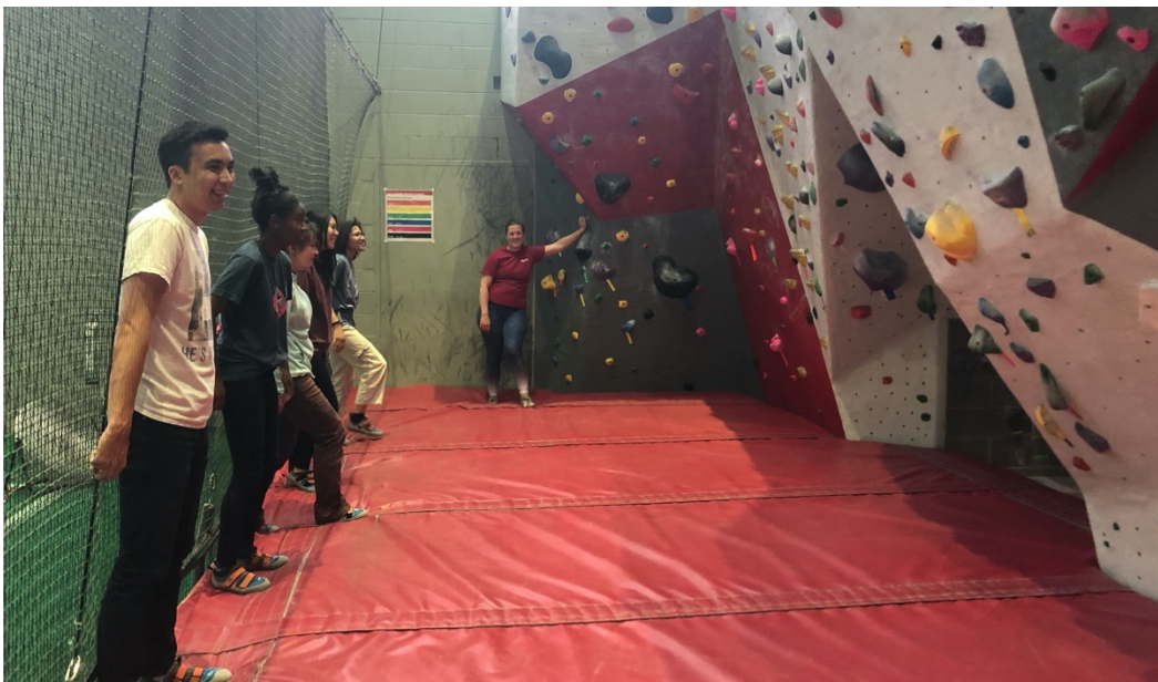
Everyone is excited to face their fears and climb the wall.