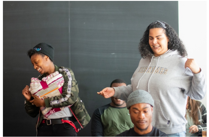
We were fortunate to have a great meal and a gift exchange in December.

“The blankets were the most popular gifts this year.”