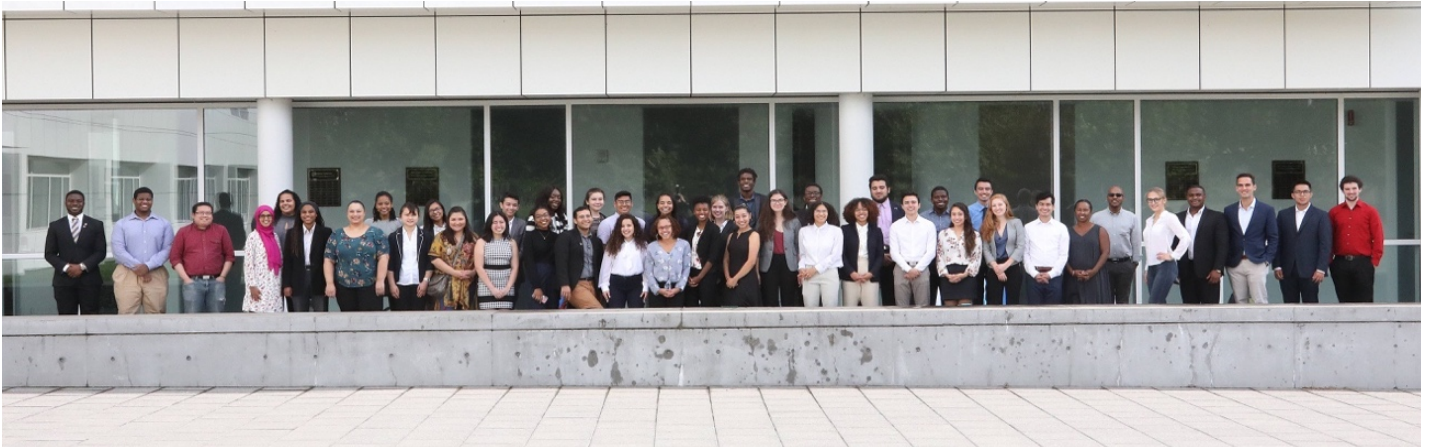
A snap shot of all who presented at the symposium.

The HHMI-CURT scholars had a great experience interacting with their fellow colleagues and presenting research at the Diversity Undergraduate Summer Research Symposium 2019 at Cornell University.