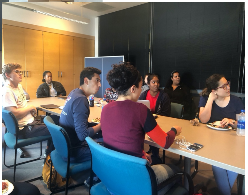
HHMI-CURT and IMSD scholars

“My favorite part of this workshop was learning the importance of self-care.”