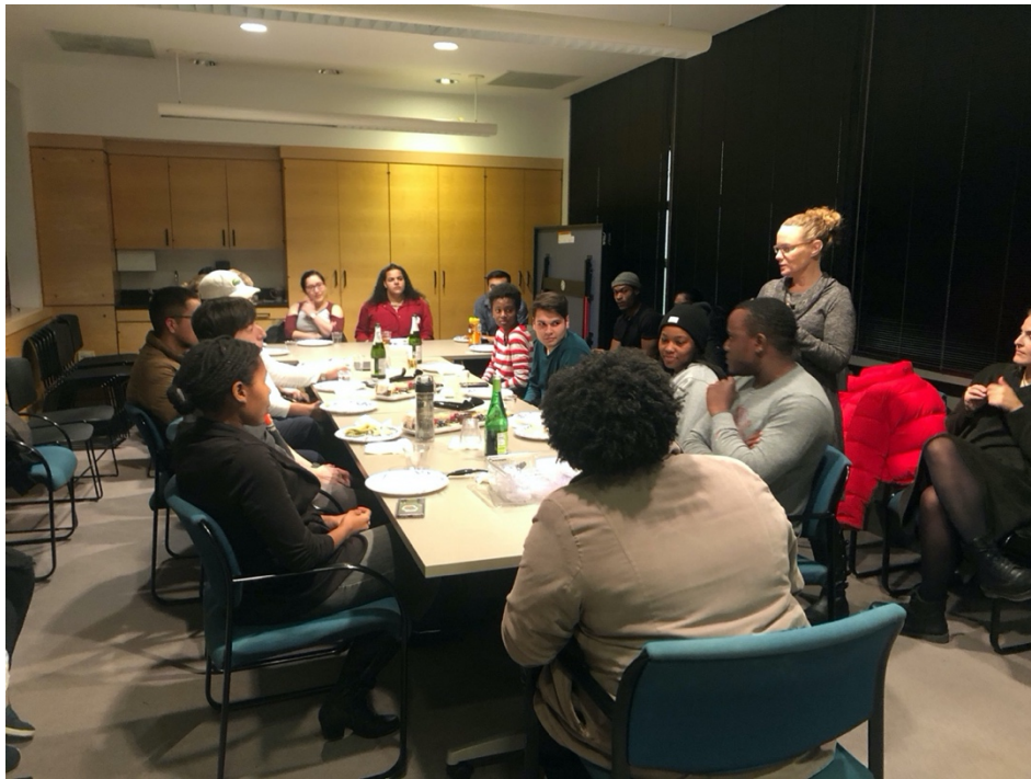
We enjoyed our November meal together.